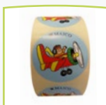
Roll of stickers