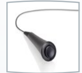
Patient response switch