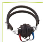
DD45 with HB7 headband