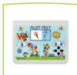
PILOT TEST device